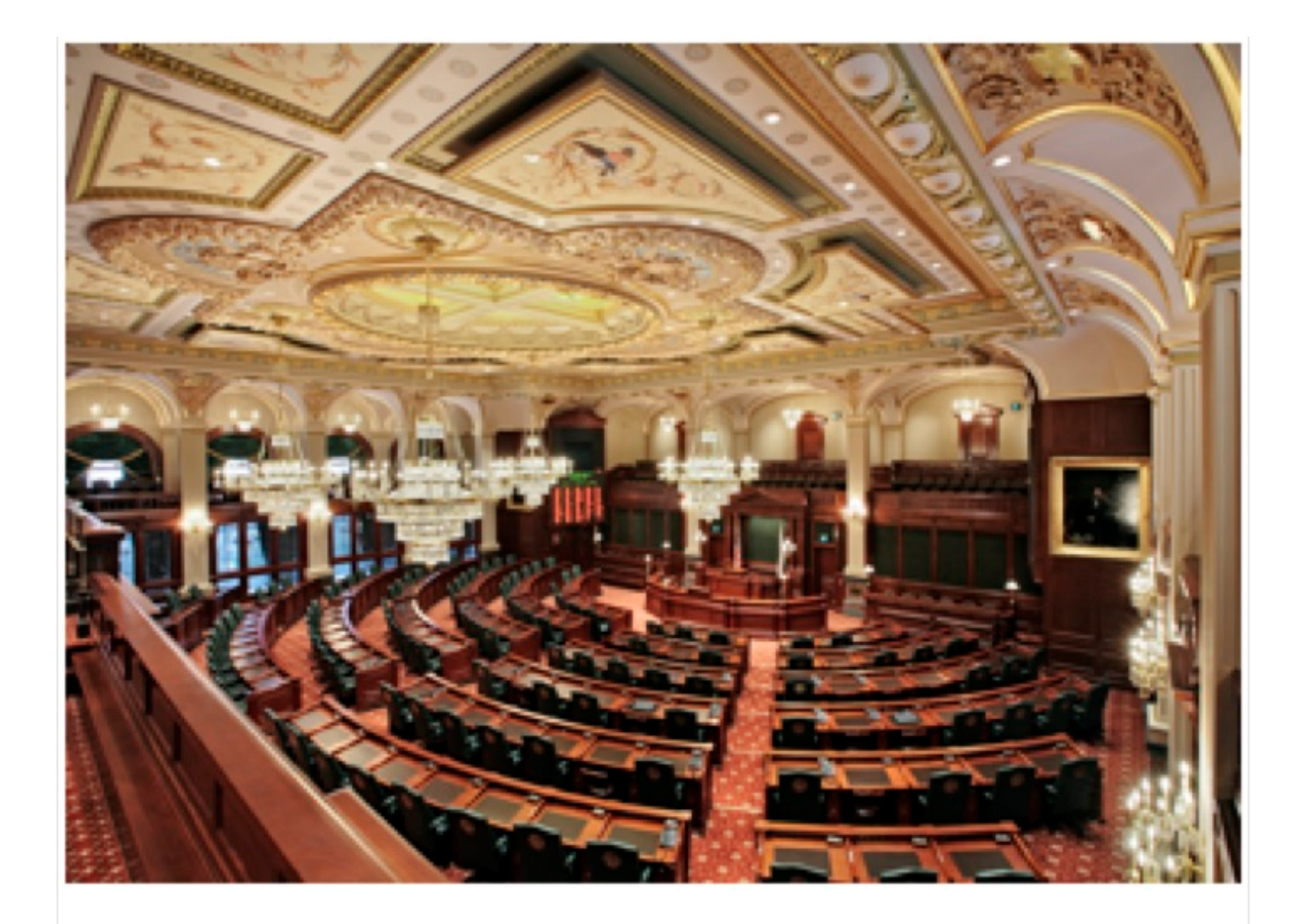
Illinois House Chambers

My largest client recently has been the university of Illinois. I've done about seven or eight projects in Champaign recently. One was a new system in Foellinger Auditorium. It seats 1,200 and makes it their largest lecture hall.